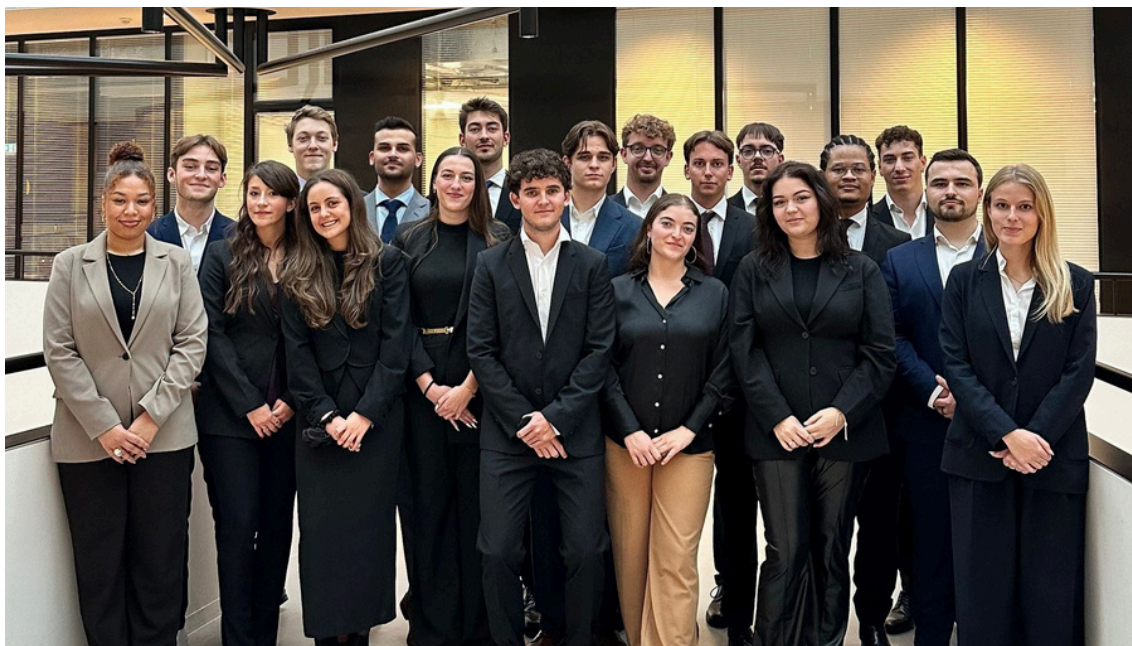
HEC Espace Entreprise 2024-2025 Team