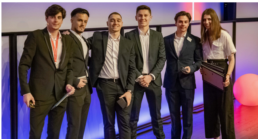
2023 FIDAG Consulting Award's Winners

Where Academia Meets Real-World Entrepreneurship